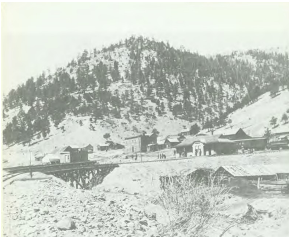
Sunset about 1900.

From the outset Lewis could not have expected to make more than a subsistence living from this venture. The company was to pay him $2.50 per day for labor in the mine and additional fees for promotional considerations. Due primarily to the tireless effort of the aging miner, the company grew rapidly. The shares of capital stock listed in 1912 were 125,000 with each share having a par value of $1. Of this amount 62,485 shares were listed as sold. Even when one considers the discrepancy between actual value and par value, the company's existence must have been better than marginal. There were 122 stockholders, placing the average investment in the neighborhood of $512 per stockholder. 29