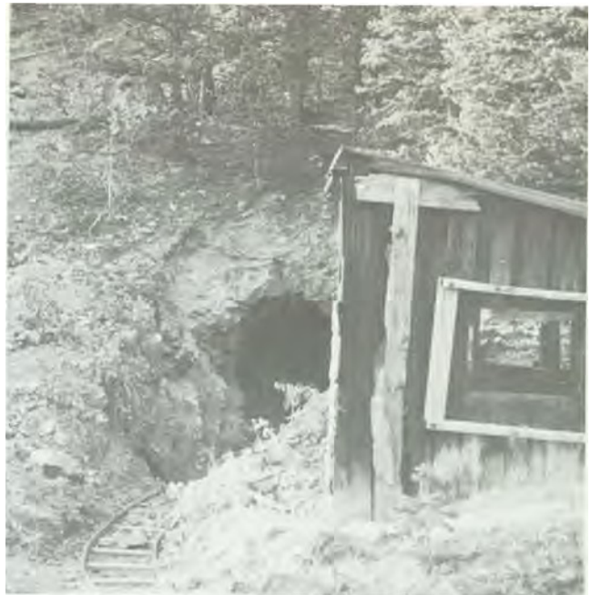
The adit and the shack (the original with some new repairs) of the Golden Chest Mine.